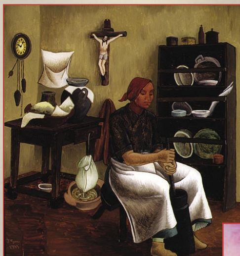
Ivan Generalić's 'Making Cheese'