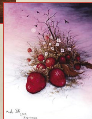
MatoToth 'Wild Strawberries'